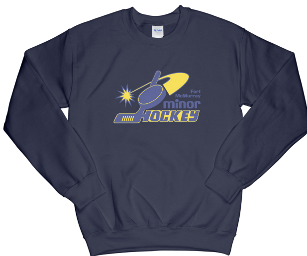
FULL FRONT PLACEMENT