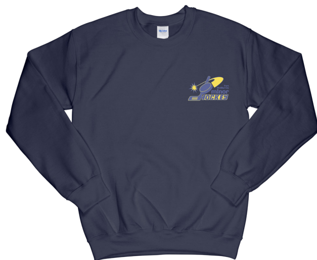
LEFT CHEST PLACEMENT