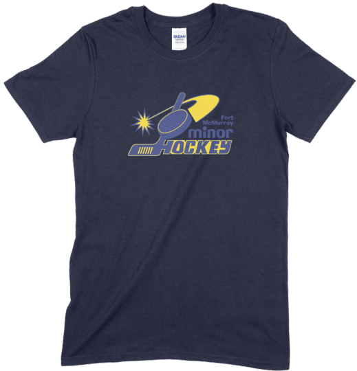
FULL FRONT PLACEMENT