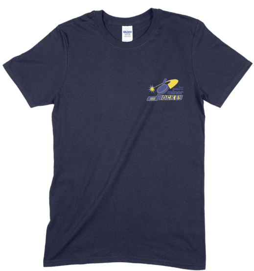
LEFT CHEST PLACEMENT