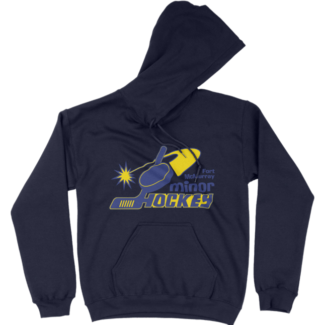
FULL FRONT PLACEMENT