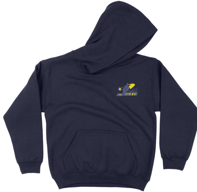
LEFT CHEST PLACEMENT